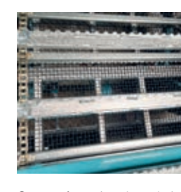
Screening sheet metal