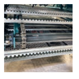
Pick-up blade with transport system unit